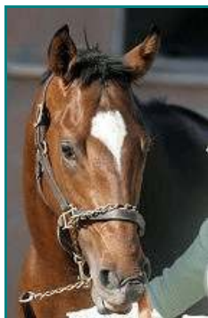
Brother Derek