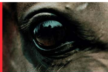
Offlee Wild, by the sire of Wild Rush out of a half-sister to Dynaformer.

When you see a big race win for Dynaformer, think Offlee Wild.