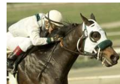
Bob and John

In 2001, trainer Bob Baffert won the Wood with Stonerside Stable's Congaree after shipping in from California. This year, Stonerside and Baffert are here with another homebred, Bob and John (Seeking the Gold). The dark bay drew off to win the GIII Sham S. Feb. 4 at Santa Anita before settling for third in the GII San Felipe S. four weeks later. He was bumped at the break before going five wide, and Baffert is hoping for an improved performance here. "He had a horrible trip last time," explained Baffert. "He got wiped out at the start by a 40-1 shot." And the competition may be a bit easier in New York. "It will be good to get away from Brother Derek," the conditioner continued. "But I'm not sure how he'd handle a wet track."