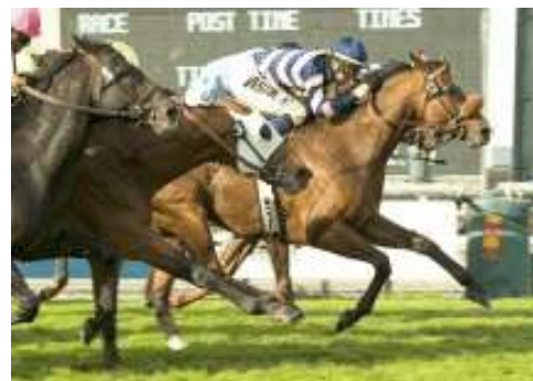
Milk It Mick Takes Kilroe Cavalry Charge

Off at 12-1 when he captured the GI Frank Kilroe Mile H. at Santa Anita Mar. 4, Milk It Mick will be one of the favorites to repeat. The five-year-old was a Group 1 winner in Britain at two, but failed to get his photo