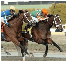
Keyed Entry (outside) in the Gotham

Three Kentucky Derby winners in the last six years--Fusaichi Pegasus (2000), Monarchos (2001) and Funny Cide (2003)--have used the GI Wood Memorial as a springboard to their success. This year, the lightly raced Keyed Entry (Honour and Glory) will be tough to run