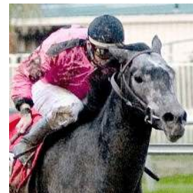
Cause to Believe