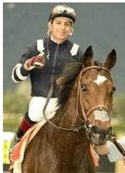
Balance