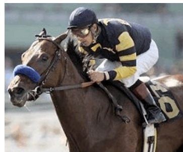
Behaving Badly

A pair of Grade I winners are set to lock horns in today's second race at Santa Anita, the $83,000 Bug Brush S. for fillies and mares, four years old and up, sprinting 6 1/2 furlongs on the main track. Bettors will