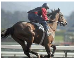
Brother Derek