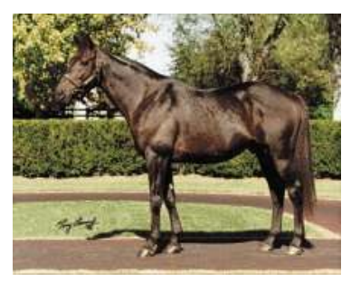
Dynaformer