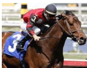
Roamin Murphy

ROAMIN MURPHY (c, 3, Grindstone--Distinct Beauty, by Phone Trick) crushed a field of Gulfstream maidens by 6 3/4 lengths Jan. 28, but ran into a pair of un-