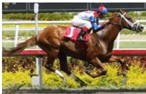
Roman Dynasty

4th-GPX, $42,000, Msw, 3yo, 1 1/8m, 1:50 1/5, ft. ROMAN DYNASTY (c, 3, Theatrical {Ire} --Vinista {SW & MGSP, $381,118}, by Jade Hunter) was second best behind a sharp maiden winner in Luxembourg on the GII Fountain of Youth S. undercard Mar. 4 and entered the starting gate here as the 4-5 chalk for trainer Todd Pletcher.