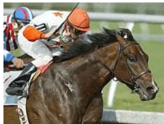
Sharp Humor Equi-Photo