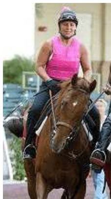
Strong Contender