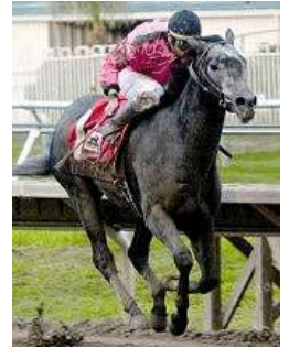
Cause to Believe