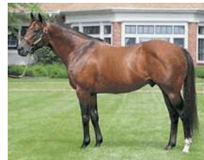
Kingmambo Lane's End

Leading sire Kingmambo (Mr. Prospector) has made a successful return to the breeding shed at Lane's End.