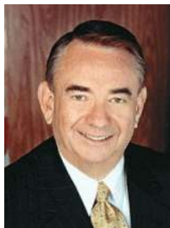
Tommy Thompson

Sophomore Flashy Bull (Holy Bull), who will go off one of the favorites in Saturday's GI Florida Derby, is owned by no fewer than 17 people through a West Point Thoroughbreds partnership. One of the those owners is Tommy Thompson, better known as the former Governor of Wisconsin and Secretary of Health & Human Services in the Bush administration from 2001 to 2005. Thompson, 64, is a new player to the racing game, having attended his first Kentucky Derby last year. The Run for the Roses left a favorable impression on Thompson, who, as he walked out of Chur-