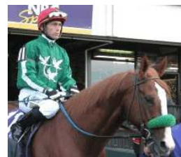
Borrego