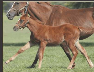
c. o/o SW BECKY VIRTUE bred in TX by Stonerside Stable