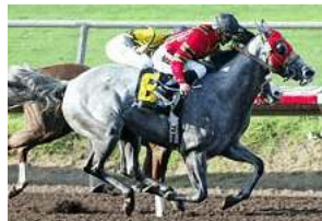
Dream of Summer