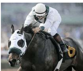
Bob and John

Stonerside Stable's Bob and John (Seeking the Gold) will be making his next start in the Apr. 8 GI Wood Memorial at Aqueduct, according to The Blood-Horse . A 4 1/2-length winner in Santa Anita's Feb. 4 GIII Sham S., the Bob Baffert trainee returned to finish third as the even-money chalk in the GII San Felipe S. behind A.P. Warrior Mar. 18. "The Santa Anita Derby may be devoid of speed, and Bob and John's style is not to chase, but to stalk,"