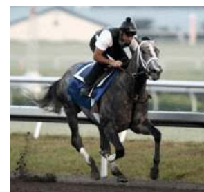
Flashy Bull