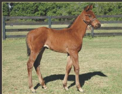
f. o/o multiple SPR WALKERTON bred in FL by McKathan Bros.