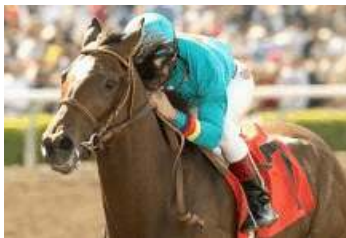
Brother Derek Benoit