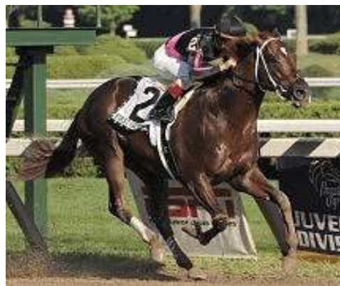
First Samurai winning the GI Hopeful S.

Some 22 days after winning the GII Fountain of Youth S. at Gulfstream via disqualification, First Samurai (Giant's Causeway) got reacquainted with the Churchill Downs strip, breezing five furlongs in an official 1:02 1/5. Ready for an anticipated start in the Apr. 15 GI Toyota Blue Grass S. at Keeneland, the chestnut