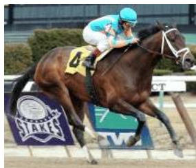
Fleet Indian