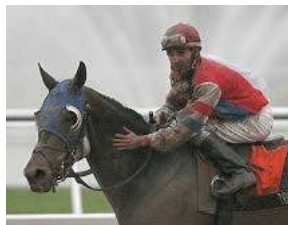
Brass Hat

Although the American two-year winning streak came to end in this year's World Cup, the trio of Brass Hat, Wilko and Magna Graduate (Honor Grades) certainly did their country proud, finishing second, third and fourth, respectively. The Todd Pletcher-trained Magna Graduate tired after vying for early command, but the duo of Brass Hat and Wilko put on a show for the Dubai faithful, locking horns