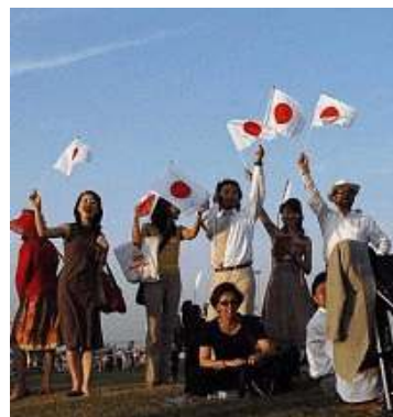
The Japanese contingent at Nad Al Sheba

In the late 1990s, Japanese horses began proving their quality overseas, with horses such as Agnes World, El Condor Pasa, Seeking the Pearl and Taiki Shuttle all winning Group 1 events on the European continent. But as the new millennium rolled around and the Japanese breeding industry continued its ascent into prominence, horses raised in the Land of the Rising Sun began to make their mark. It was at Nad Al Sheba in 2001 that Japan effectively announced its arrival on the world scene, as Sunday Silence's son Stay Gold