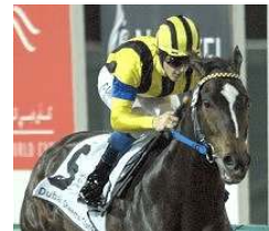
Heart's Cry