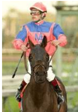
Silver Cup

Silver Cup closed out last season with a fourth-place finish behind Beautyandthebeast in a Santa Anita allowance Dec. 29, but hasn't tasted defeat yet this year, notching the GII San Gorgonio H. Jan. 8 and the GII Buena Vista H.