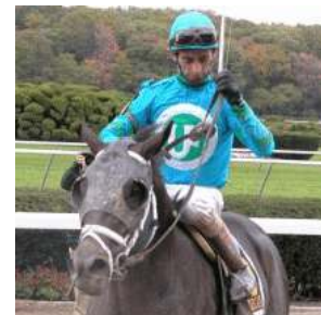
Magna Graduate Sherackatthetrack