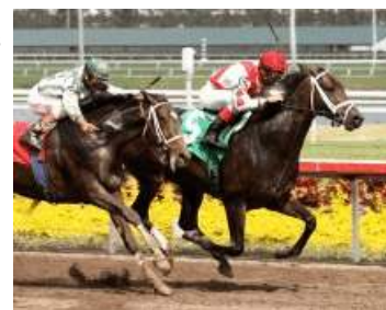
High Blues runs 2nd to Sunriver Equi-Photo

High Blues (High Yield), a late nominee to the Apr. 1 GI Florida Derby at Gulfstream Park, is now listed as probable for the $1 million event. The dark bay colt was third behind Corinthian in a Gulfstream allowance test Feb. 2 and most recently ran