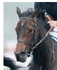
Ouija Board