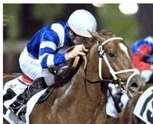
Gold for Sale A Watkins

Gold for Sale (Arg) (Not for Sale {Arg}) was five-for-five in his native country, closing from the middle of the pack to win the G1 Argentine 2000 Guineas by four lengths in his final South American start. The chestnut colt came back after nearly five months on the sidelines to best Where's That Tiger (Storm Cat) by a rallying half-length in the Feb. 19 G3 UAE 2000 Guineas. He stretches out beyond a mile for the first time.