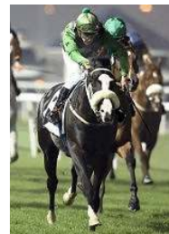
Oracle West