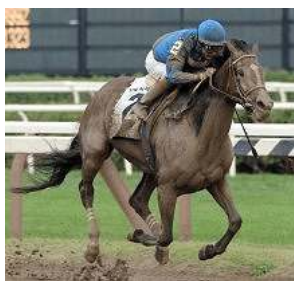
Sweet Symphony

Sweet Symphony stamped herself as a top sophomore filly last season after taking the GI Alabama S. by 6 1/4 lengths, but couldn't carry that momentum into the fall. She suffered her first career defeat when fourth