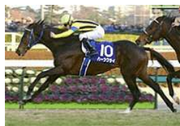
Heart's Cry

Heart's Cry (Jpn) (Sunday Silence) lost a squeaker in the G1 Japan Cup in November, but rebounded by defeating Triple Crown hero Deep Impact (Jpn) in the Arima Kinen in December at Nakayama and was voted the country's champion older horse. He will attempt to duplicate Stay Gold (Jpn)'s feat in 2001 when he won this contest for owners Shadai Race Horse.