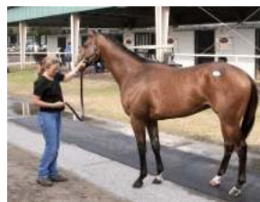
Hip 205

The Darley team also employed trans-Atlantic communications to secure hip 205 , a colt by A.P. Indy out of MGSW Poolesta (Ire) (Hero's Honor), for $250,000.