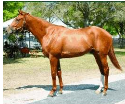
Officer-Ocean View Colt Hip 181 sold for $190k at OBS