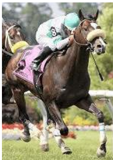
War Trace