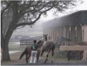
OBS in the Rain