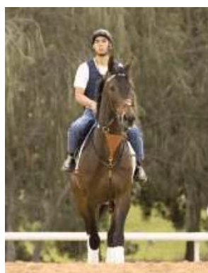
World Cup hopeful Brass Hat at Nad Al Sheba

Fields for the five stakes races on the undercard of Saturday's G1 Dubai World Cup program at Nad Al Sheba were drawn yesterday. A competitive field of 14 will go postward in the $5-million G1 Dubai Sheema Classic, with world-travelling super mare Ouija Board (GB) (Cape Cross {Ire}) leading the way. Winner of the