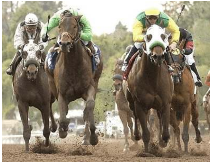
A.P. Warrior (lime green) defeats Point Determined (inside, blinkers), with Bob and John (outside, blinkers) third

While Saturday's GII San Felipe S. hero A.P. Warrior (A.P. Indy) "looks good" and will be pointed for the GI Santa Anita Derby Apr. 8, plans for the Bob Baffert-trained second- and third-place finishers Point Determined (Point Given) and Bob and John (Seeking the