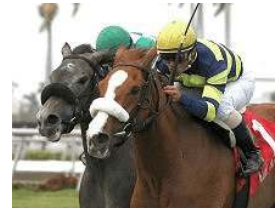
Aunt Henny