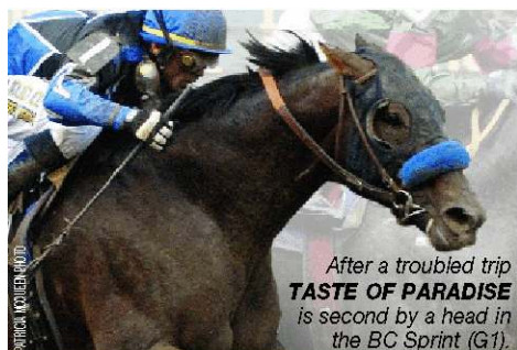
After a troubled trip TASTE OF PARADISE is second by a head in the BC Sprint (G1).

"But the bargain of the year in this price range has to be TASTE OF PARADISE ... He should have won the race ('05 Breeders' Cup Sprint) for sure and still ran a Beyer 114 in losing by a head to Silver Train... 'unluckiest loser of the day' translates into 'big bargain for breeders'."