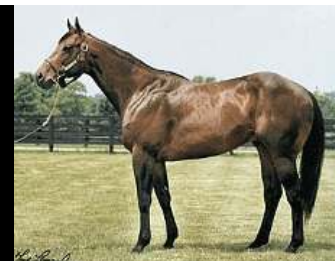
2006 BOOK FULL