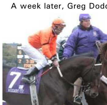
Lost in the Fog Sherackatthetrack

At OBS March, the colt, already named Lost in the Fog, breezed a good eighth in :10 3/5, and the Dodds entered the sale with high expectations. Bidding stalled out on Lost in the Fog approaching the $200,000 mark, however--the mark at which the Dodds were prepared to part with him--and he was led out of the ring unsold at $195,000.