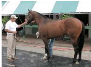
The Green Monkey