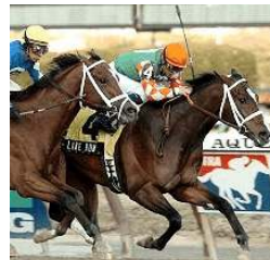
Like Now