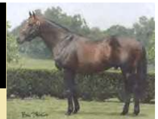
Deputy Commander $10,000 LFG

RED RAYMOND comes from last to finish second in the $300,000 GIII Rebel S.!