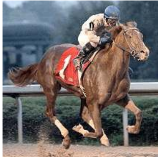
Lawyer Ron