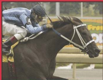
AWESOME ACTION ($467,724)

Fifth Annual ADENA SPRINGS TWO-YEAR-OLDS in Training Sale