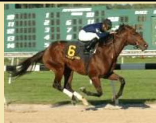
Deputy Glitters winning the GIII Tampa Bay Derby

DEPUTY GLITTERS easily wins the $250,000 GIII Tampa Bay Derby defeating top Derby prospect Bluegrass Cat!