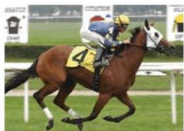
G2 SW Spanish Chestnut