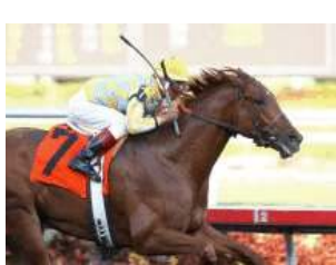
Strong Contender

Strong Contender (Maria's Mon) worked five furlongs in :59 4/5 at Gulfstream Park yesterday in his final major preparatory move ahead of a start in the GII