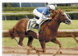
G1 SW Lucifer's Stone