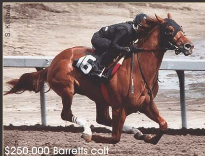
$250,000 Barretts colt