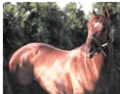
Thunder Gulch

Unfortunately, having made a very bright start with his first two crops, Thunder Gulch then lost some momentum. The typically difficult third season resulted in a crop which yielded just two stakes winners, and his fourth season was spent in Japan. To compound things, his fifth season, back in the U.S. came on the heels of the relatively quiet start made by his first two-year-olds. Thunder Gulch's next two crops, however, were conceived following