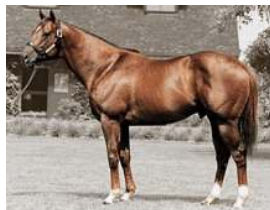
Distorted Humor, sire of top colt and filly