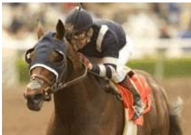
Balance winning the SA Oaks

wards, and the GI Santa Anita Oaks, for three-year-olds. The winners of both these races were sired by stallions who left these shores for Japan, but whereas the export of Boston Harbor--sire of the Santa Margarita heroine Healthy Addiction--appears to be permanent, Thunder