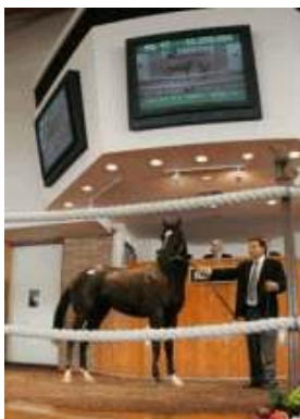
Hip 47