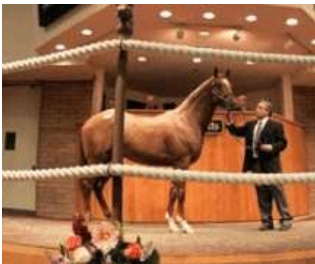
Hip 177