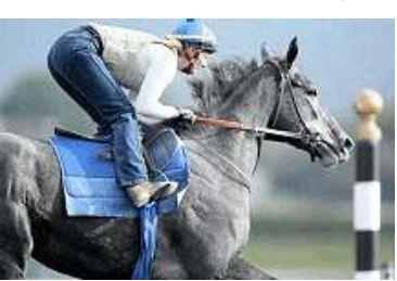
Island Fashion

Fashion (Petionville) and Shamoan (Ire) (Monashee Mountain) will be joining the cast for the Mar. 25 G2