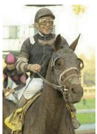
Balance after the Las Virgenes Benoit photo

Possessed of a pedigree more likely to excel on the turf, Balance (Thunder Gulch) has nevertheless made a name for herself on the main track and looks to continue on the road to the first Friday in May in this after-