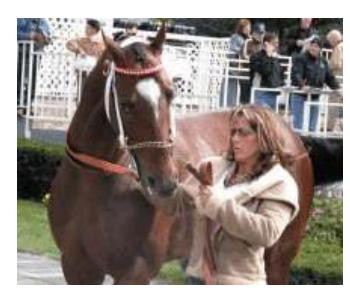
Choctaw Nation

Choctaw Nation (Louis Quatorze), who upset Pleasantly Perfect in the 2004 GII San Diego H., will start next in