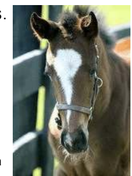
Lady Pegasus as a foal

third in Belmont's Colonial Minstrel S. Sept. 29, missed by 3/4 of a length in a Churchill allowance Nov. 17 before finishing the year with a second going a mile over this surface Dec. 31. The 5-2 third choice set a pressured pace and, after being collared in the stretch and losing the lead, fought back to deny stablemate Notre Dame (Brz) (Royal Academy) by a neck. The Stonerside homebred is a half-sister to Thunder Kitten (Storm Cat), GSW, $253,138; and Nobo