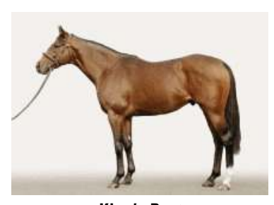
King's Best darleystallions.com

RECORDS FALL AT INGLIS The final session of Inglis' Premier Sale (Session 1) at Oaklands concluded on a high note with new records established in average,