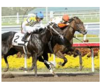
Sharp Humor (inside) edges favored Noonmark Equi-photo

Of the last 12 winners of the Swale, only Trippi,