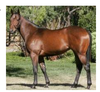
Hip 259, the second-highest lot at Inglis at A$430,000 inalis.com.au

[G1] Australian Guines [Saturday]," said Rogerson. "We're back in the family now and I think she's going to be a good filly." Leading the colts, Lot 475 reeled in top price of $A320,000 from Woodlands Stud. Out of the group-winning mare Apple Danish (Aus) (Danehill), the bay was consigned by Goulburn Park. Overall, session figures for average and median rose 25 percent over the comparable