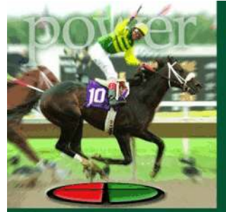
Champion Orientate winning Breeders' Cup Sprint-G1