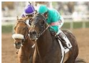
Spellbinder