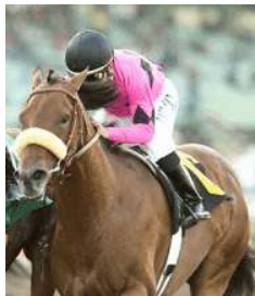
High Limit

High Limit (Maria's Mon), a very promising sophomore last season, looks to have gotten his act back together after hitting a rough patch and leads the way in today's GI Santa Anita H. A sharp winner of the GII Louisiana Derby, he went winless in his next six starts, including a 20th-place finish in the GI Kentucky Derby behind Giacomo (Holy Bull). The bay has turned things around so far this season though, beginning the new year with a nose victory in the GII San Pasqual H. Jan. 7 and following with an impressive 4 1/2-length tally in the GII Strub S. Feb. 4. High