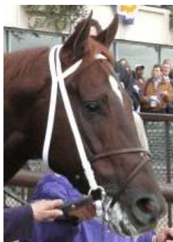
First Samurai

First Samurai , last year's winner of the GI Hopeful S. and the GI Champagne S., will have a host of challengers for his two-turn debut here. The chestnut closed out his juvenile campaign with a third-place finish as the 6-5 chalk in the GI Breeders' Cup Juvenile S. Oct. 29 and splashed his way home to a second-place finish behind the razor sharp Keyed Entry in the GII Hutcheson S. Feb. 4. My Golden Song debuted with a visually impressive maiden score on Breeders' Cup eve last fall and reached a career high Beyer of 90 when third behind Barbaro and Great Point in the GIII Holy Bull S. Feb. 4. "I thought he ran a good