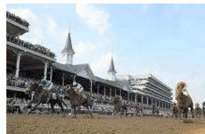
'05 Derby