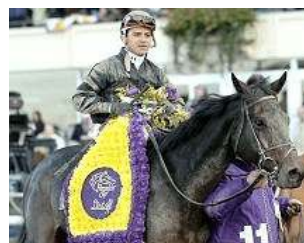
Our Country Place's daughter Pleasant Home