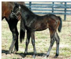
filly at Milford Farm