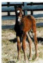
colt at Claiborne