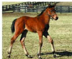
colt at Lantern Hill

With fields averaging nearly 10 horses in each of its six added-money events, Gulfstream Park has assembled an outstanding program tomorrow, including the two-turn debut of First Samurai (Giant's Causeway) in the GII Fountain of Youth S. The field also includes GIII Holy Bull S. runner-up and third-place finisher Great Point (Point Given) and My Golden Song (Unbridled's Song), as well as the promising Corinthian (Pulpit) and Jazil (Seeking the Gold). The co-featured GII Gulfstream Park H. has attracted a Grade I-caliber octet, including Funny Cide (Distorted Humor), Suave (A.P. Indy) and Sun King (Charismatic), while the GII Richter Scale Breeders' Cup Sprint Championship H. has drawn reigning GI Breeders' Cup Sprint hero Silver Train (Old Trieste). The GII Swale S. features an evenly matched group of sophomore sprinters. Noonmark (Unbridled's Song) and In Summation (Put It Back) could vie for favoritism in the seven-furlong event. Fields p4-5