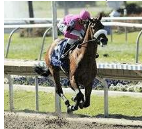
High Limit