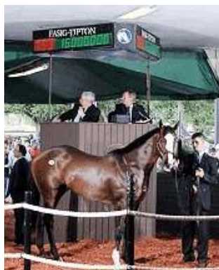
Hip 153