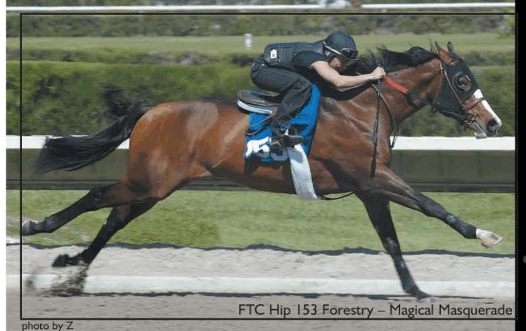
FTC Hip 153 Forestry - Magical Masquerade