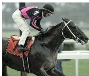
First Samurai

First Samurai (Giant's Causeway), a multiple Grade I winning juvenile, makes his much anticipated two-turn debut in Saturday's GII Fountain of Youth S. at