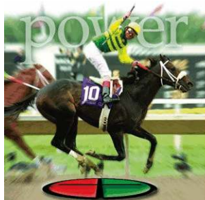
Orientate Breeders' Cup Sprint-G1