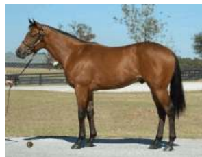
Hip 154, by Street Cry eddiwoods.com

The pool of juveniles by first-crop sires available tomorrow is deep and, for many, offers an enticing dip in the uncharted waters of potential. While some buyers are reticent about purchasing a horse by an unproven quantity, juveniles by freshman sires typically sell well. A total of 14 freshman are represented, including the offspring of 11 Grade I winners. Three of those, GI Wood Memorial winner Buddha (Unbridled's Song), GI Breeders' Cup Sprint champ Orientate (Mt. Livermore), and GI Hopeful S.