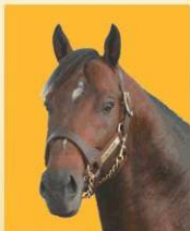
MALIBU MOON Sire of Eclipse Champion 2YO, Declan's Moon by A.P. INDY $30,000 (book full)