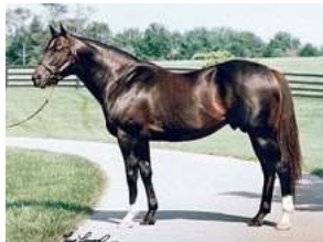
Storm Cat Tony Leonard

With 28 yearlings sold last year for an average of $1,763,750, getting your hands on a son or daughter of leading sire Storm Cat can be an expensive chore. But late foaling dates and imperfect conformation, among other factors, allowed some pinhookers to acquire Storm Cats for relatively inexpensive prices last year. A total of seven Storm Cats have been cataloged at Fasig-Tipton, a number that eclipses all of the Storm Cat juveniles offered in 2005. Last year, five were offered, with three sold at an average of $731,098. Included in that group was a daughter of Turbo Launch who sold at this sale for $1.5 million from the Hartley/DeRenzo consignment.