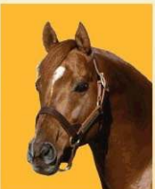
WISEMAN'S FERRY By Leading 2YO Sire HENNESSY $8,500

WE'LL HELP PAY FOR SHIPPING YOUR MARE TO KENTUCKY. Call for details.