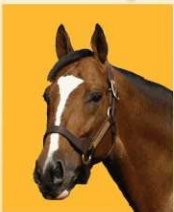
TOCCE 2YO Rocket who won 2 Grade 1's at two by AWESOME AGAIN $15,000