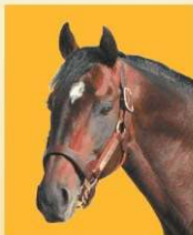
BERNSTEIN Sire of 13 Stakes Winners in 2005 by STORM CAT $25,000