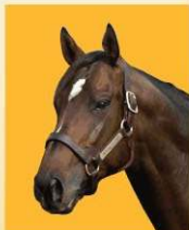
ACTION THIS DAY Eclipse Champion 2YO by KRIS S. 2006 fee: $10,000