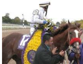
Stevie Wonderboy Sherackatthetrack

With the past two editions of the Fasig-Tipton Calder juvenile sale establishing record for gross, and world-record bids falling at each, there is good reason to be optimistic about this year's sale. Part, if not all, of the success of Fasig-Tipton Calder and other juvenile sales can be attributed to the achievements of its graduates, and 2005 was a banner year for runners that began their careers facing the stopwatch in Miami. No fewer than five individual