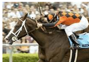
Buzzard's Bay