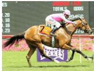
Ticker Tape