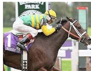
Folklore