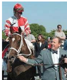
Round Pond