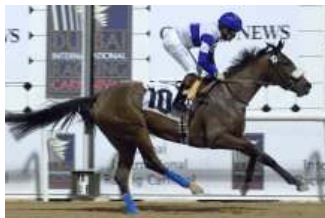
Vague