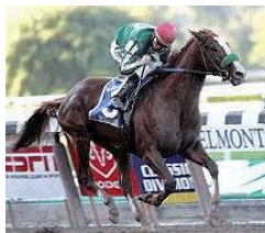
Borrego at Belmont