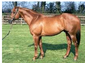
Pivotal Cheveley Park photo

RUSSIAN RHYTHM FOALS A FILLY Champion Russian Rhythm (Kingmambo--Balistroika, by Nijinsky II) produced her first foal, a filly by Pivotal (GB) at