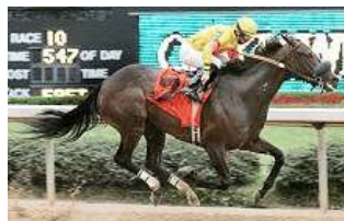
Two Trail Sioux