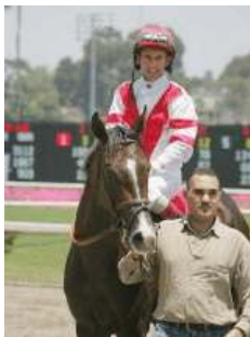
Splendid Blended