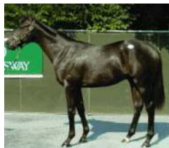
Orientate-French Line colt sold for $400,000 at Saratoga 2005