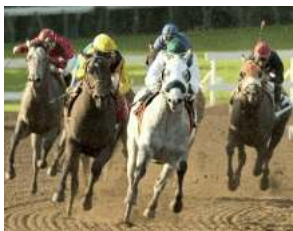
Too Much Bling

Proving his dynamic win in the Jan. 8 San Miguel S. was no fluke, Too Much Bling (Rubiano) offered up a gutsy performance in yesterday's GII San Vicente S., dueling through wicked fractions and pulling clear late for his first graded win. Remarkably, it was the fifth time in the last 10 years the San Vicente has gone to a Bob Baffert runner, and the silver-haired conditioner was impressed by what he saw. "P. Val [jockey Pat Valenzuela]'s horse