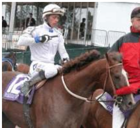
Stevie Wonderboy following the BC Juvenile Sherackatthetrack