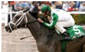
Wait a While