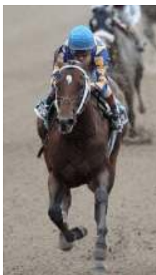
Private Vow