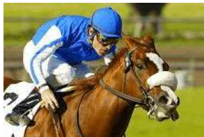
Spanish Chestnut