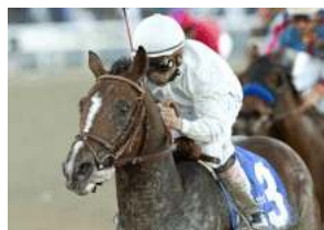
Your Tent or Mine