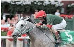
'03 grad Silver Wagon winning the Hopeful