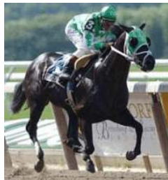
OBS grad Bossanova

Fresh off the high enjoyed by pinhookers during the 2004 season, 2005 proved to be problematic for many. While it's true that the year did bring numerous triumphs, including the world-record price of $5.2 million