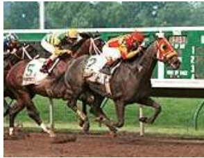
'95 OBS Feb grad Skip Away

Ocala Breeders' Sales Company gets the two-year-old sale season rolling Tuesday at noon with its Selected Two-Year-Old in Training Sale at Calder Race Course.