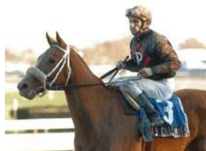
Miraculous Miss