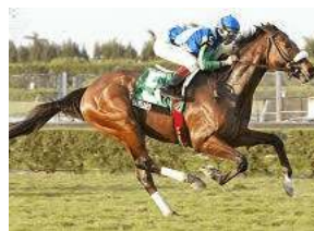
Barbaro