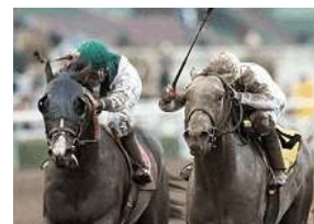
Canteen (outside)