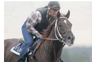
First Samurai

First Samurai (Giant's Causeway), one of the glamour names of 2005, will make his three-year-old bow today in the GII Hutcheson S. at