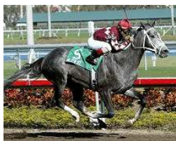
On Thin Ice