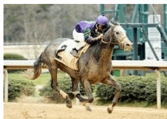
Steppenwolver

2nd-OPX, $34,000, Alw, NW2X, 3yo, 1m, 1:40 2/5, gd. STEPPENWOLFER (c, 3, Aptitude --Wolfier {GSP, $221,148}, by Wolf Power {SAf}) defeated the promising Jazil in an Aqueduct maiden Nov. 12 before finishing a good third in a two-turn allowance at Louisiana Downs Dec. 17. The $25,000 KEESEP yearling and $375,000 OBSAPR juvenile made amends in his latest, coming from well off the pace to clear that condition by a head Jan. 7. Favored here at 3-2, the gray colt was steadied hard leaving the clubhouse turn and was shuffled back to last. Taken to the four path for the run around the final turn, he inhaled the field in a matter of strides and drew off to a decisive 4 1/2-length victory. Pacesetter Rocket Beauty (Cape Canaveral) was second, a nose better than Kings Challenge (Elusive Quality). The winner could make his next start in the $250,000 Southwest S. Feb. 20. Lifetime Record: 5-3-0-1, $81,520.