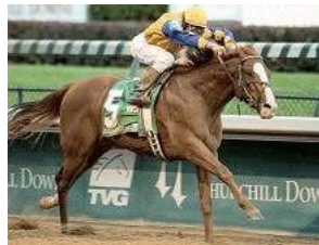
Catcominatcha