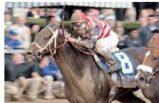
Runway Model at Keeneland