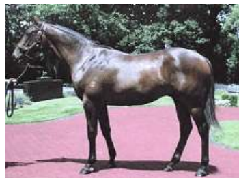
Hip 461 cambridgestud.co.nz

The third and final day of the New Zealand Premier Yearling Sale at Karaka finished strongly yesterday, with a colt by Zabeel (NZ) attracting a NZ$1.6 million bid from Graeme Rogerson. Expectations were high as lot 461 stepped into the ring, with many believing the Cambridge Stud consignee would become the second