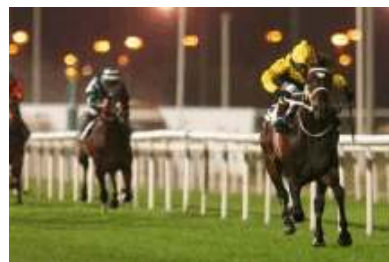
Greys Inn winning the City of Gold