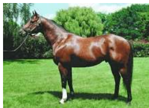
Stravinsky Cambridge Stud photo