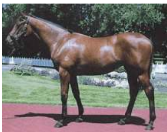
Hip 59 - Zabeel filly Cambridge Stud photo

A filly by star stallion Zabeel (NZ) topped Monday's opening session of the New Zealand Premier Yearling at Karaka when Australian trainer David Hayes signed the ticket at NZ$850,000 for lot 59. The bay, consigned by Cambridge Stud, was produced by Silk Slippers (Aus) (Woodman), a half-sister to Group 1 winners Hurricane Sky (Aus) and Umatilla (Aus) as well as Shantha's Choice (Aus), the dam of champion and leading young sire Redoute's Choice (Aus). The day's highest-priced colt—the only male among the top six