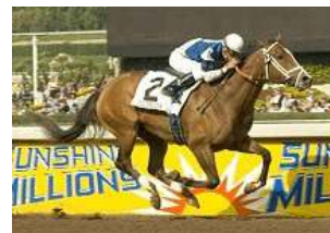
Hot Storm

Funnily enough, the runner-up to Hot Storm on Saturday was a mare by General Meeting, a stallion who also demonstrated the potential of inbreeding to Seattle Slew by siring that very good filly Yearly Report (2x4). Event of the Year's good daughter Thrilling Victory and Capote's daughter Croisiere are others inbred 2x4, while the Grade II-placed High Cotton and the stakes-winning Sound Moon were two successful 2005 juveniles with inbreeding to Seattle Slew.