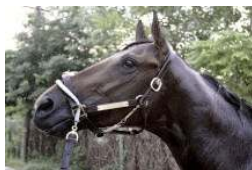
Sun King Equi-Photo