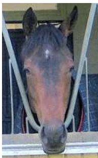
Ouija Board