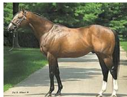
Stormy Atlantic

Sure enough, last year's list of leading sires in Florida features the second-crop sire Tiger Ridge in an encouraging eighth place. But the list doesn't reflect the solid achievements of another of Storm Cat's royally bred sons, Stormy Atlantic, simply because he left Florida for Kentucky at the end of 2002. Theoretically, Stormy Atlantic ought to have been included on the Florida list, as all of his