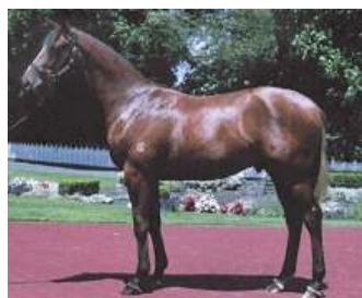
Hip 62 - Zabeel colt