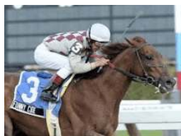
Funny Cide