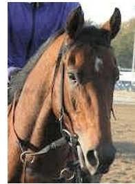
Dark Cheetah Sherackatthetrack

DARK CHEETAH (c, 4, Storm Cat--Layounne, by Mt. Livermore) missed by just a neck in the Belgrave S. at