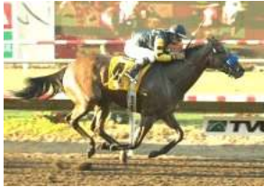
Behaving Badly