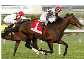
Miesque's Approval

Miesque's Approval exploded from the three-eighths pole and withstood a furious late rally from odds-on