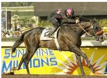
Lava Man