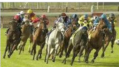
TOP OF THE STRETCH Moscow Burning (red cap) far outside

months. Included in that stretch was last year's renewal of this contest at Gulfstream, where she came up 3/4 of a length short when fifth to Valentine Dancer . The Cal-bred had picked up checks in several Grade I events, but was given a break when she could only manage fifth in the