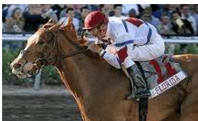
Joint Effort

Cup Juvenile Fillies Sept. 17, the Disney homebred was bumped and never factored in the GII Darley Alcibiades S. Oct. 7. She turned things around with a second in a Churchill allowance Nov. 5 before getting her picture taken under the Twin Spires in a