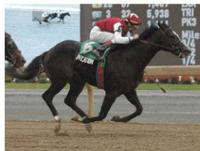
Graded winner UNIFICATION purchased by Darley Stud, won the Grey Breeders' Cup Stakes in his third start. Consignor: Sequel Bloodstock, Agent

Additional Promising Graduates Purchased at Barretts March in 2005 include: