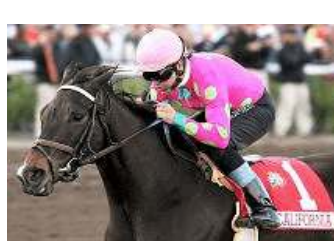
House of Fortune

As a three-year-old, House of Fortune posted wins in the GII Fantasy S. and GII Hollywood Breeders' Cup