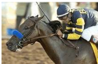
Behaving Badly

A field of nine distaff sprinters, including four Grade/Group 1 winners will face off in today's GI Santa Monica H. at Santa Anita. The California-bred pair of Alphabet Kisses (Alphabet Soup) and Leave Me Alone (Bold Badgett) each opted for prestige over cash by scratching out of the Sunshine Millions F/M Sprint yesterday, but it won't be easy. The fastest speed figures in the race belong to Behaving Badly (Pioneering), winner of the Gill Rancho Bernardo H. at Del