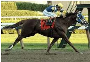
Flower Alley A Coglianese

A total of 159 horses representing 13 different countries have been nominated at the first stage for the $6-million G1 Dubai World Cup scheduled for Saturday, Mar. 25 at Nad Al Sheba Racecourse. American horses