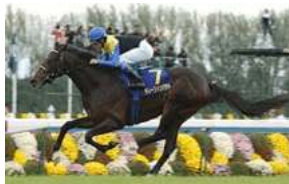
Deep Impact