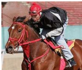
Afleet Alex

Afleet Alex and his stakes-winning brother Unforgettable Max (also retiring to stud in Kentucky for 2006) are out of Maggy Hawk, a daughter of the Roberto-line sire, Hawkster. The pair represent the cross of a Mr. Prospector-line stallion over a Roberto-line mare. This combination brings together two important daughters of Nashua--Gold Digger, the dam of Mr. Prospector, and Bramalea, the dam of Roberto--a pair who have a very