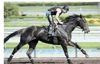
Rock Hard Ten

We long held that while inbreeding, linebreeding and outcross can all be effective, that none are a "silver bullet," and that what is more important is who are we inbreeding to, through, and where. Most of the nominees have duplications within five generations (as does most of the Thoroughbred population). Of the 27 horses on the ballots, seven (26 percent) were outcrosses, and eight (30 percent) had duplications within four generations (or equivalent). The inbreds are Stevie Wonderboy (Weekend Surprise 3x3), Ashado (Cosmah 3x5), Folklore (In Reality 4x4), Rock Hard Ten (Hail to Reason 3x4, Nashua 4x4), Pleasant Home (Mr. Prospector 2x4), Flower Alley (Mr. Prospector 3x3, Northern Dancer 4x4x 5), Cesario (Northern Dancer 5x3) and Round Pond (the brothers Viceregal/Vice Regent 3x4). Three crosses of Northern Dancer are becoming quite common in the pedigrees of good horses, and three of the nominees, Folklore, Flower Alley and Round Pond, have three crosses of Northern Dancer in five generations.