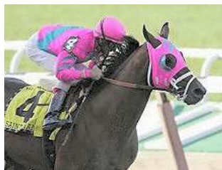
Saint Liam