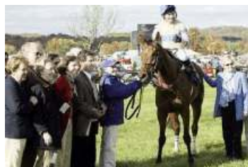
'04 BC Celebration

McDynamo, named the country's top steeplechaser in 2003, lost that title to Hirapour (Ire) in 2004 and was slow out of the blocks in 2005, but recorded an historic triple in the Breeders' Cup to secure a second stint as Eclipse champion. The eight-year-old veteran began the year with a third-place finish behind Hirapour in the GI