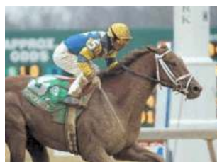
Flower Alley