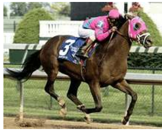
Saint Liam