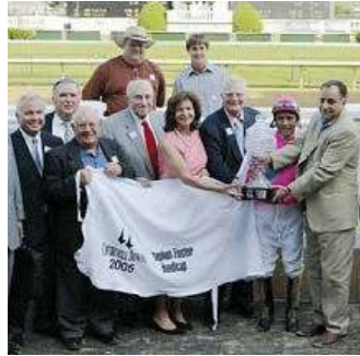
Stephen Foster Winner's Circle

It's hard to fault a season that included Grade I victories at Gulfstream Park (Donn H., video ), Churchill