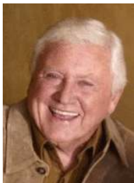
Merv Griffin