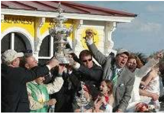
Preakness Celebration

It was the moment that will forever define him. Afleet Alex was charging towards victory in the GI Preakness S. ( video ) when Scrapy T veered in front of him. With no time to react, the bay was caught on his rival's