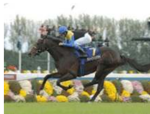
Deep Impact

Deep Impact (Jpn) (Sunday Silence), who last year became the first undefeated Triple Crown winner in Japan in 21 years, has been named the near-unanimous winner of the Japan Racing Association's 2005 Horse of the Year award, with 285 of the 291 votes. He was the unanimous selection as champion three-year-old. Hearts Cry (Jpn) (Sunday Silence), who snapped Deep Impact's unbeaten streak on Christmas Day in the G1 Arima Kinen S., was named champion older male and was the only other horse considered for the year's biggest award. Cesario (Jpn) (Special Week {Jpn}), the striking ebony miss who shipped to America and won the GI American Oaks, was honored as top three-year-old filly. It was another superlative year for Sunday Silence. The late stallion, who changed the face of the Japanese breeding world, was the sire of three JRA champions, while sons of Sunday Silence were responsible for another three.