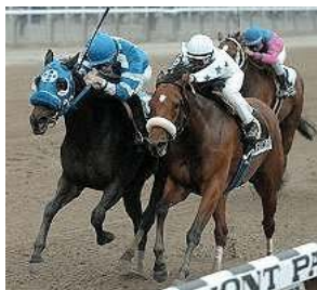
Umpateedle (left)