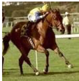
The Tin Man

At the ripe old age of eight, The Tin Man (Affirmed) showed he still had some fight left in him with a game victory in yesterday's GII San Marcos H. at Santa Anita. Never far behind a solid early pace carved out by defending San Marcos champ Whilly (Ire) (Sri Pekan), the gelding sat off the Irish-bred's hip until midstretch and forged ahead of that rival in the final strides to collect his second victory in a month.