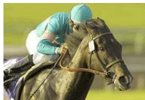
Tarlow

TARLOW RETIRED Grade I winner Tarlow (Stormin Fever--Madam Bear, by Dreadnought), out of action since last March, has been retired, according to Daily Racing Form . The five-year-old mare has been sent to Mill Ridge Farm in Kentucky, but breeding plans have not yet been announced. Third in the GII El Encino S. last January to kick off her four-year-old season, the dark bay landed the GII La Canada S. Feb. 12 before proving a game