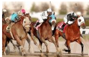
Attila's Storm