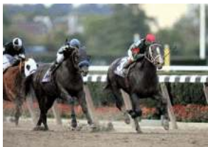
2005 BC Sprint