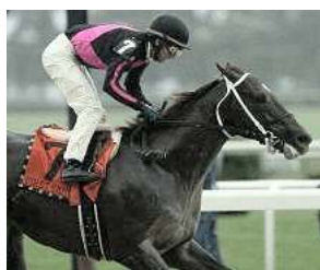
First Samurai