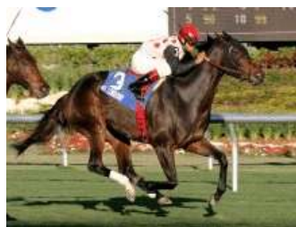
My Lordship

My Lordship, winner of the restricted Voodoo Dancer S. at Belmont last May, lost a pair of heartbreakers later in the summer, a runner-up finish to Cloak of Vague-