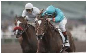
Brother Derek

It was billed as a two-horse race and it certainly panned out that way in yesterday's GII San Rafael S. at Santa Anita, with Brother Derek (Benchmark) getting