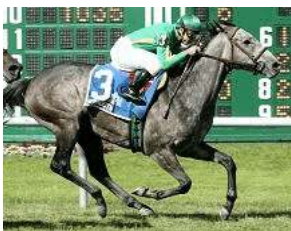
Snowdrops in front at Monmouth Equi-Photo