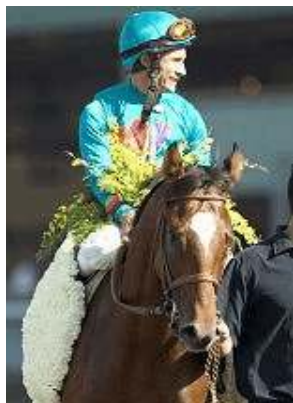
Brother Derek