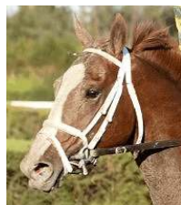
Saint Augustus