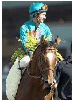
Brother Derek