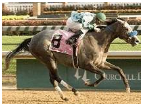
French Park Four Footed Foto

French Park fulfilled the promise of her 12 1/4-length debut win at Keeneland in October with a pair of graded stakes victories. After taking the GIII Pocahontas S. at a one-turn mile at Churchill Nov. 5, the grey filly overcame trouble on the first turn to land the GII Golden Rod S. under the Twin Spires Nov. 26 and looms the one to beat. Stakes winner Capozzene returned from a two-month break to run second by a length in the Three Ring S. at Calder Dec. 3 and adds blinkers this time.