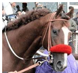
Stevie Wonderboy

It's just two weeks into the New Year, but Santa Anita will feature a clash between the two most accomplished West Coast-based colts of 2005 in today's GII San Rafael S. Eclipse favorite Stevie Wonderboy (Stephen Got Even), off since winning the GI Breeders' Cup Juvenile at Belmont Oct. 29, will make his three-year-old debut here while facing a tough competitor in Brother Derek (Benchmark). The California-bred bay followed his game victory in the GII Norfolk S. Oct. 2