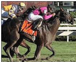
Mass Media at Saratoga

MASS MEDIA BACK IN TRAINING Mass Media (Touch Gold--Sultry Allure, by Forty Niner), who was retired to Hill 'n' Dale Farm in Lexington, Kentucky.