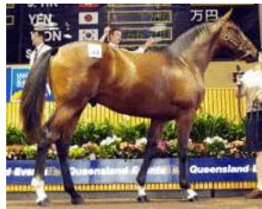
Lot 41

Ten-time Melbourne Cup winning trainer Bart Cummings struck early when he secured a colt by Redoute's Choice (Aus) for A$900,000, outstaying underbidders which included Darley. Selling as Lot 41, the bay is out of the Luskin Star (Aus) mare Click (Aus), a half sister to Epsom H. winner Nick's Joy (Aus). He was consigned by Newhaven Park Stud. "We valued him between A$800,000 and A$1,000,000, so we were quite happy," Cummings said.