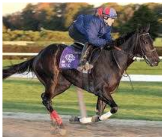
Solvig at the track