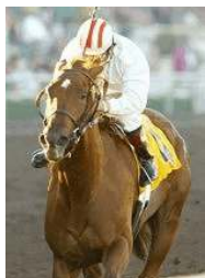
Girl Warrior