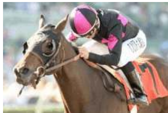
Itty Bitty Pretty

Itty Bitty Pretty is the first stakes winner for her dam, Topsy Girl, but Topsy Girl has bred eight other winners from nine starters, including the stakes-placed Easy Action, Subito and Canaan Land, all by sons or grandsons of Mr. Prospector. She's also granddam of the stakes-placed Fresh Tracks, who is by El Corredor's broodmare sire, Silver Deputy. Topsy Girl was talented runner in her own right, winning eight races and $285,817. She gained stakes victories in the Majorette H. and Breeders' Cup Weekend Delight S., and among her six stakes placings was a second in the GIII Honey Bee H., and thirds in the GIII Shirley Jones H. and GIII Brown & Williamson H.