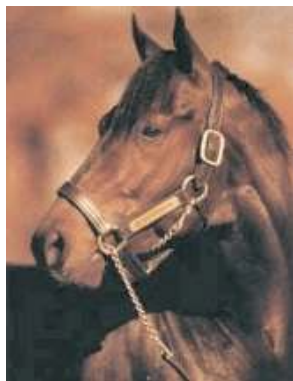
El Corredor