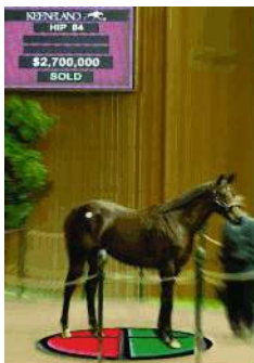
Keeneland September Mr. Greeley Filly Sold for $2.7 million