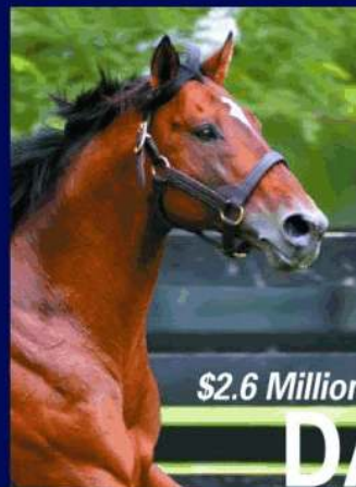
$2.6 Million Son of Halo