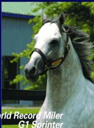
World Record Miler G1 Sprinter