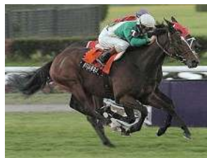
Atlando