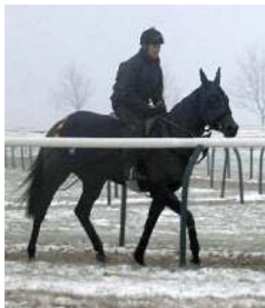
Ouija Board