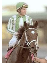
Johar

unprecedented repeat victory in the G1 Tenno Sho at this track Nov. 2. The Thoroughbred Corporation's Johar (Gone West) will try to become the first U.S.-based horse to win the Japan Cup since Golden Pheasant scored in 1991. Lightly raced and making just his fifth start of the season today, the son of Windsharp seeks to become the first winner of the Breeders' Cup Turf to follow up in this event. Singspiel (Ire), second in the 1996 Turf, did go on to Japan Cup success, while that year's Turf winner, Pilsudski (Ire), took the '97 Japan Cup. Cont. p2