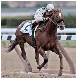
Congaree

Maintaining his perfect record at Aqueduct, Congaree (Arazi) successfully defended his title in the GI Cigar Mile H. by dispatching the talented three-year-olds Midas Eyes (Touch Gold) and Toccet (Awesome Again) with this 5 1/4-length triumph. It was the third Grade I victory on the year for the five-year-old, who captured