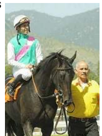
Heat Haze

The 23rd renewal of the GI Matriarch, which will be contested at a mile for the first time, has drawn a stellar field of 14, including six Grade/Group 1 winners. The 7-2 morning-line favorite is Etoile Montante (Miswaki), who makes her U.S. bow on the strength of an excellent French campaign. She will be joined in the starting gate by fellow Juddmonte star Heat Haze (GB) (Green Desert), who could stake her claim for an Eclipse Award with a win here. Cont. p3